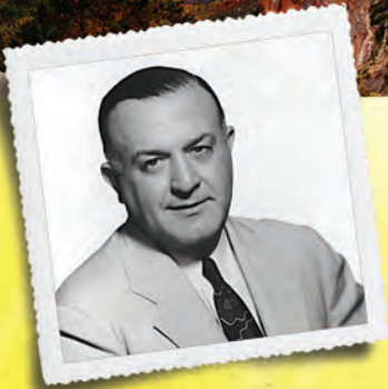
American composer Ferde Grofé