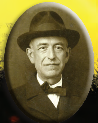
Spanish composer Manuel de Falla

Don't try this at home! Instead, listen to see if the melody and the rhythms suggest the wild, unpredictable flicker of open flames.