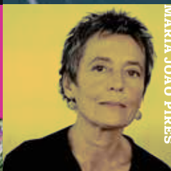
MARIA JOÃO PIRES