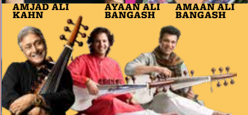
AMJAD ALI KAHN