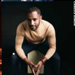
MARC BAMUTHI JOSEPH