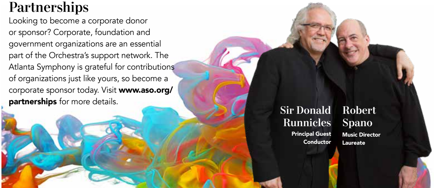
Sir Donald Runnicles Principal Guest Conductor

Looking to become a corporate donor or sponsor? Corporate, foundation and government organizations are an essential part of the Orchestra's support network. The Atlanta Symphony is grateful for contributions of organizations just like yours, so become a corporate sponsor today. Visit www.aso.org/partnerships for more details.